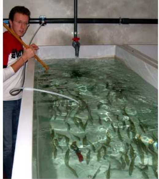
Operations in stabulation tanks.