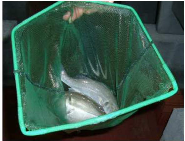
Captured adult sea bass.