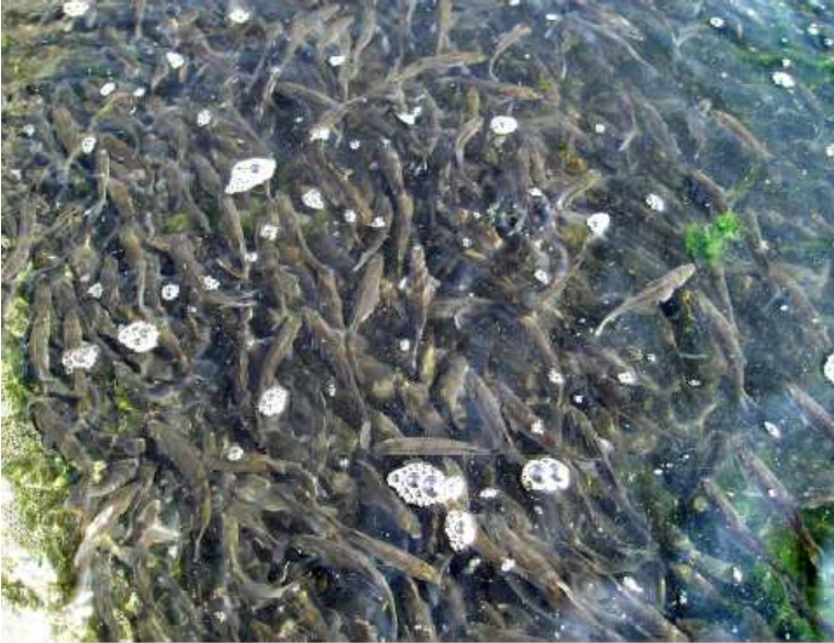
Sea bass juveniles in tanks.